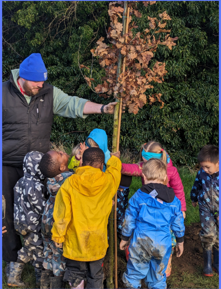
EYFS PLANTING TREES IN FOREST SCHOOL