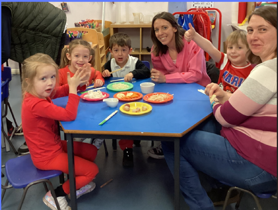
CHINESE NEW YEAR