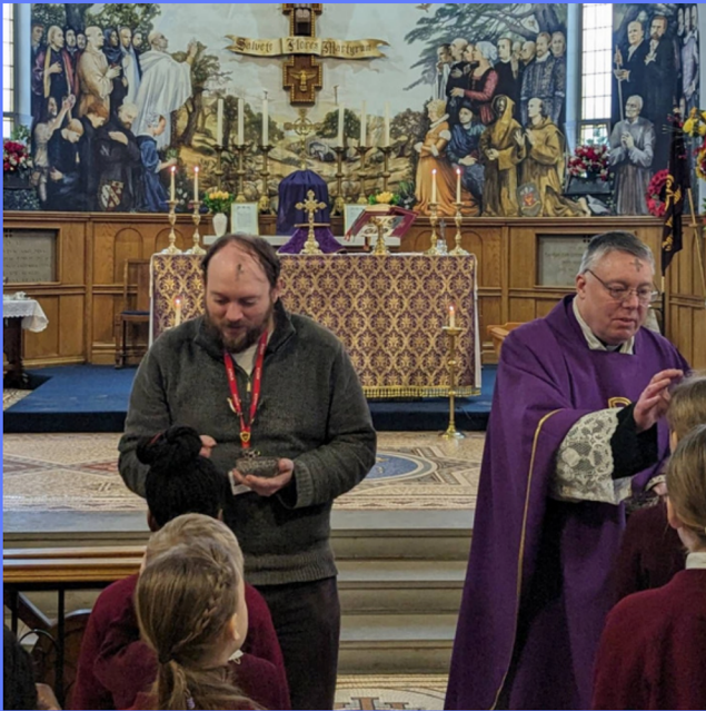
ASH WEDNESDAY SERVICE